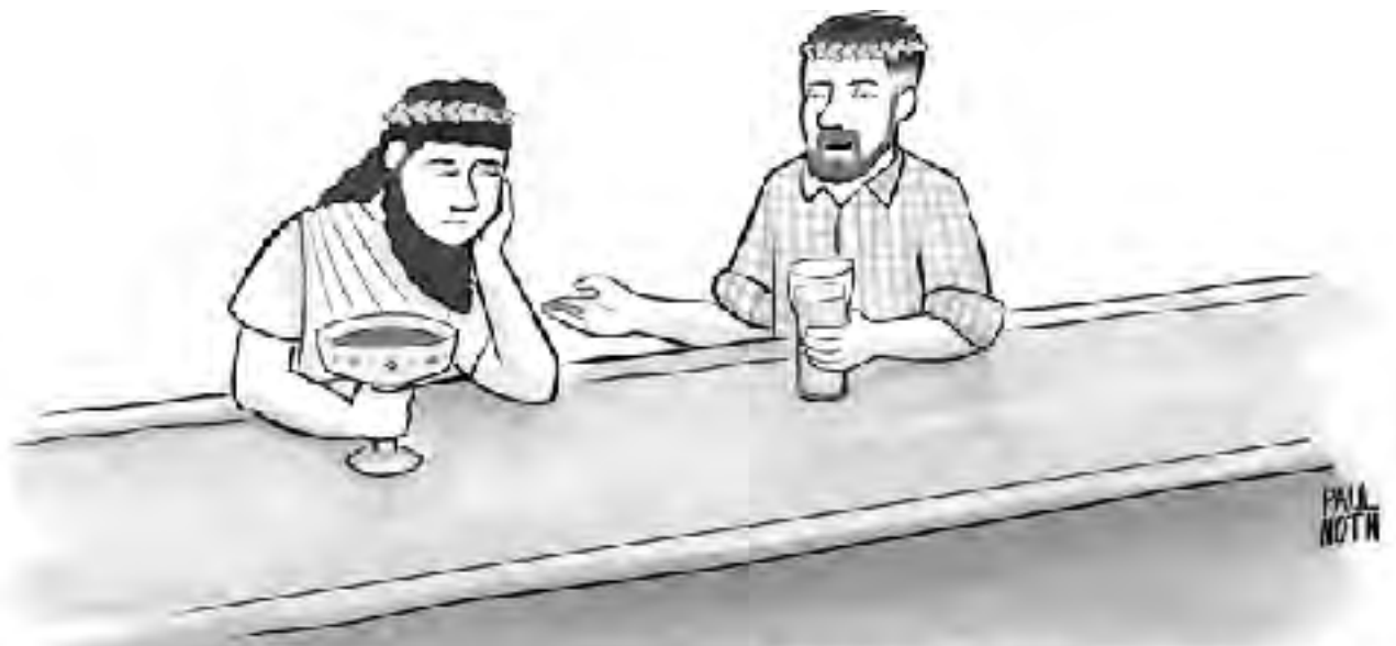
DIONYSUS, GOD OF WINE, MEETS TEDIUS, GOD OF CRAFT BEER