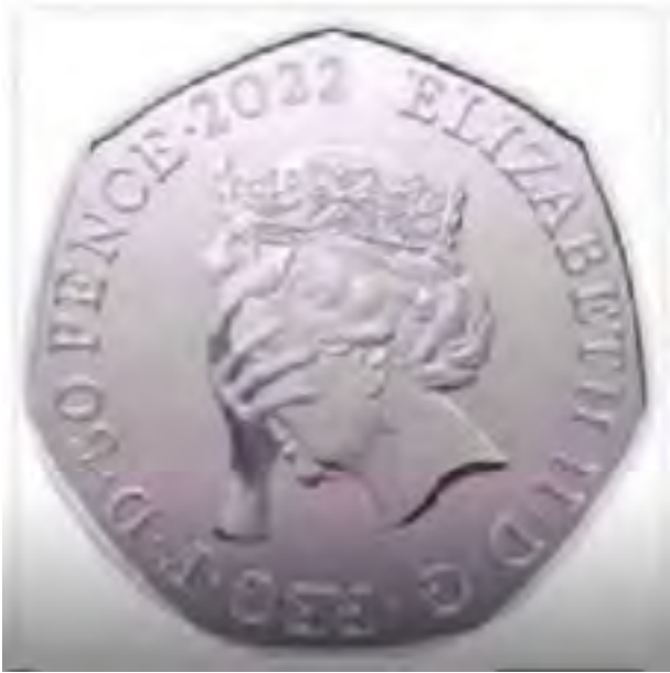
Prince Andrew Commemorative Coin